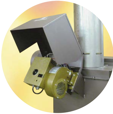
Model A200 Gas-Fired Burner Unit