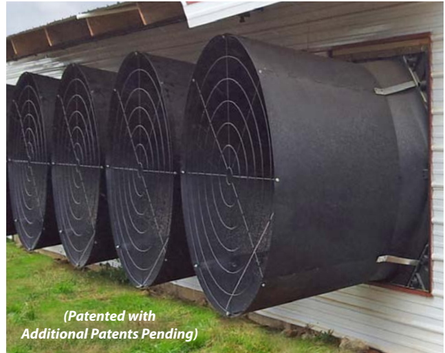
(Patented with Additional Patents Pending)

Chore-Time's 57-Inch (145-cm) ENDURA® Fan with HYFLO® Shutter features an industry-leading combination of outstanding performance and strategic material selection.