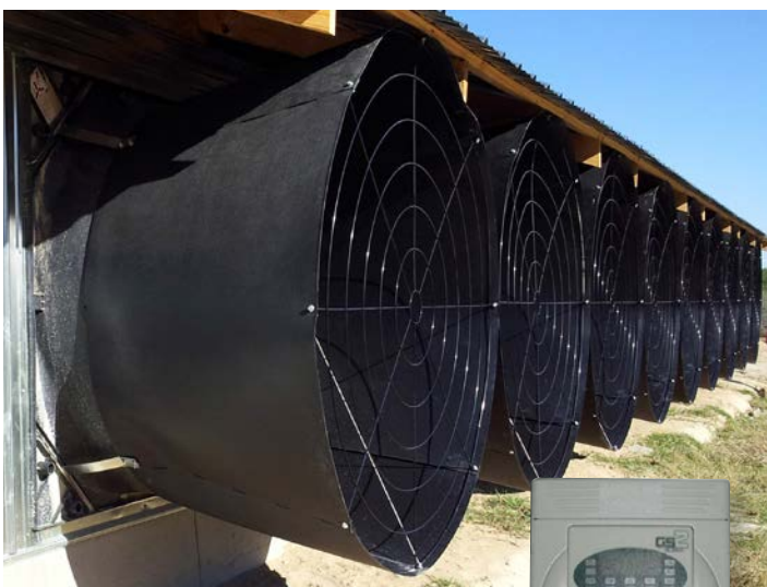
CHORE-TIME® Variable Frequency Drive