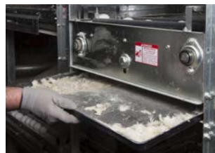
Easily removable trays below the mini rod conveyor collect foreign matter.