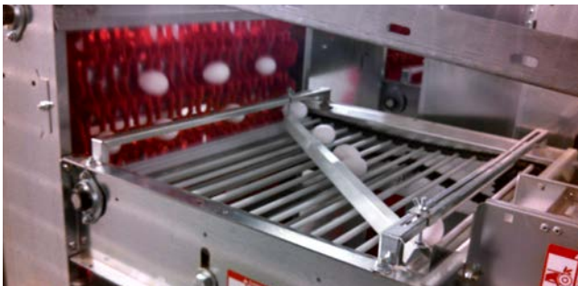
As eggs move from egg belts across a mini rod conveyor, trash drops through before eggs enter collector baskets.