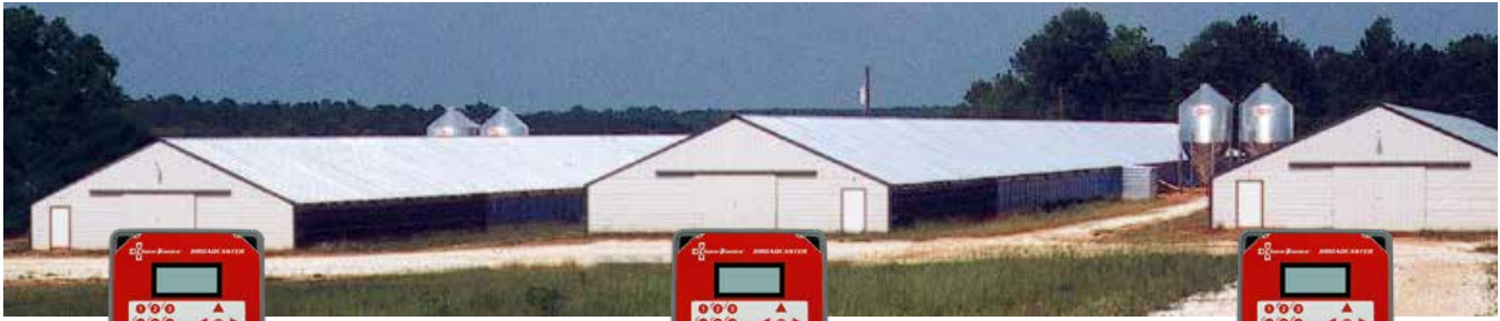
BROADCASTER™ Main Box