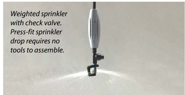
Weighted sprinkler with check valve. Press-fit sprinkler drop requires no tools to assemble.