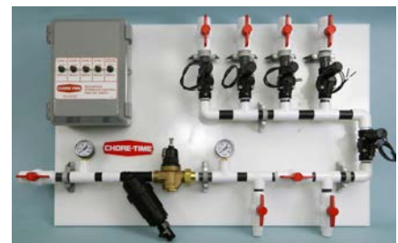
4-zone sequential control panel with doser option shown – one of six available control panel options