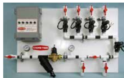
4-zone sequential control panel with doser option shown – one of six available control panel options