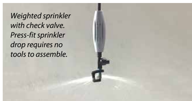
Weighted sprinkler with check valve. Press-fit sprinkler drop requires no tools to assemble.