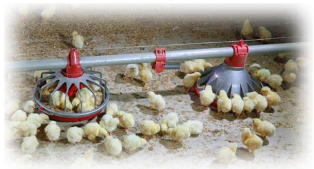
Three Days Old