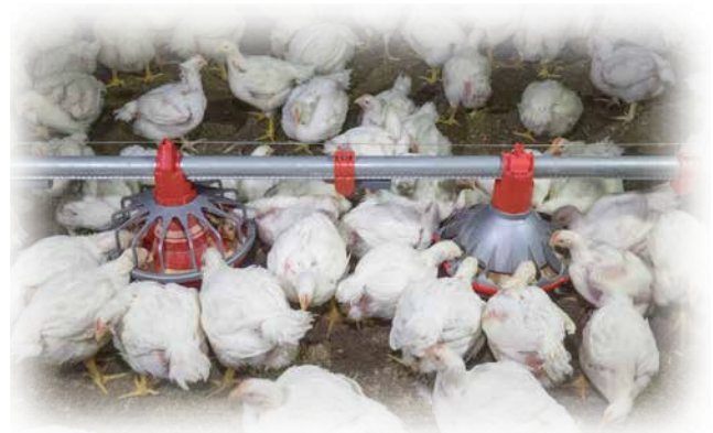
39 Days Old

Adolescent birds may still climb inside gridded feeders. They block access to feed for other birds and contaminate the feed with their droppings.