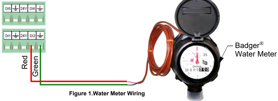
Figure 1. Water Meter Wiring

Chore-Tronics™ Control D1 of your choice