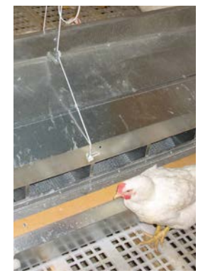
Automated Lid-Closing System