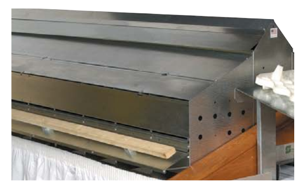
Chore-Time® Center-Belt Nest (Lids Closed)