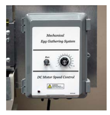
Egg flow to the table is controlled by a run/pause toggle switch and a belt speed adjustment knob.