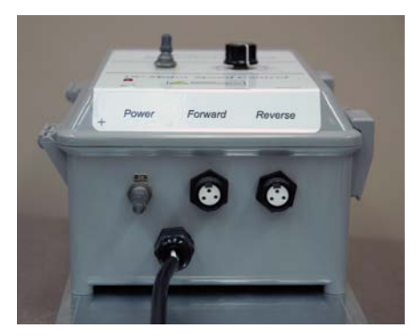
Belt direction (forward and reverse) can be changed easily on the bottom of the control. Drive control housing is moisture resistant.