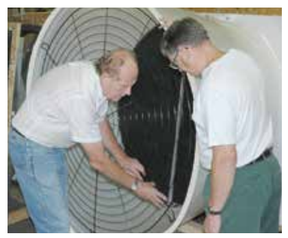
Regionally Located Service Team