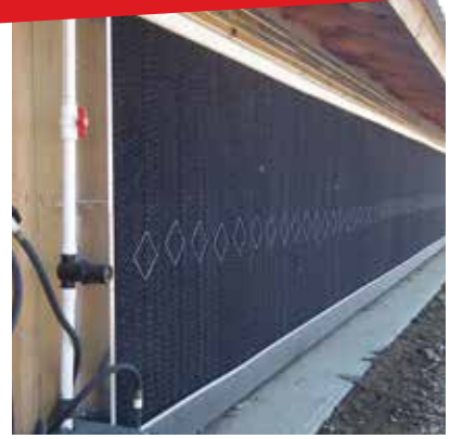
TURBO-COOL<sup>™</sup> Evaporative Cooling