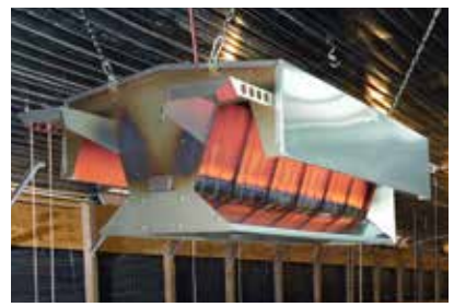
CHORE-TIME QUADRATHERM® Heater