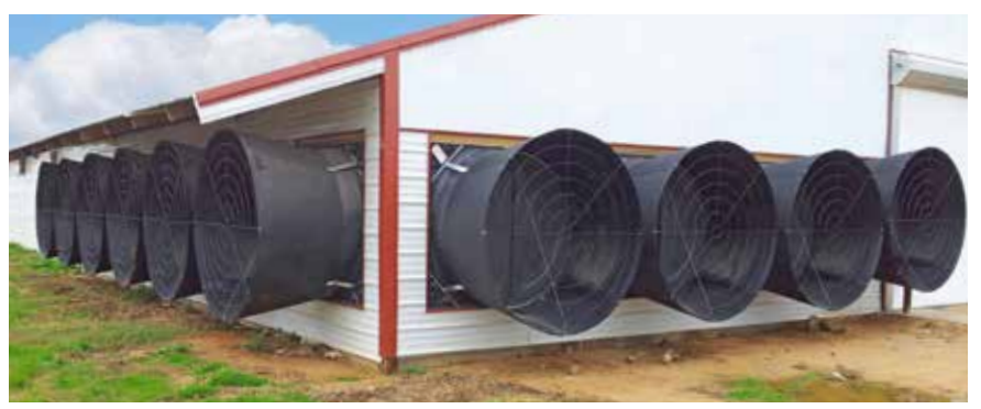
Chore-Time's Energy-Efficient, Corrosion-Resistant 57-Inch (145-cm) ENDURA® Fans