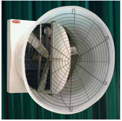
TURBO<sup>®</sup> Fans with HYFLO<sup>®</sup> Shutters