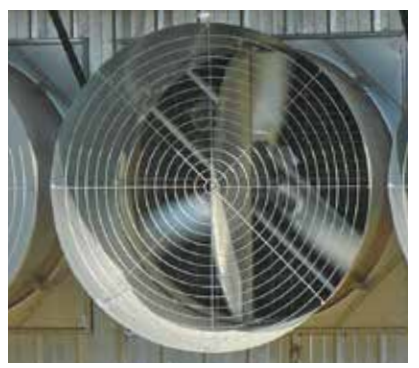
54-Inch (137-cm) Galvanized Fans