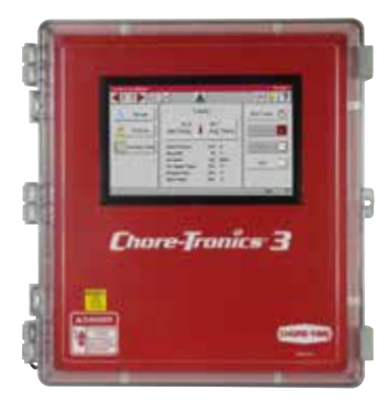
CHORE-TRONICS® 3 Controls