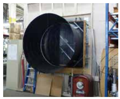
Tested in Our Own Wind Tunnel

Chore-Time's years of service to the poultry industry demonstrate our dedication to developing leading products to help poultry growers around the world. We are committed to designing, testing, and proving our equipment in the field before we offer it to you through our experienced and well-trained independent authorized distributors. Chore-Time's ventilation systems are: Made to Work. Built to Last.®