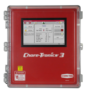
CHORE-TRONICS® 3 Controls