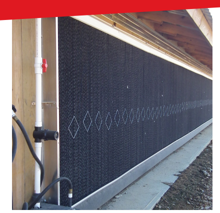
TURBO-COOL™ Evaporative Cooling