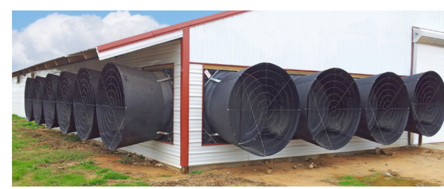
Chore-Time's Energy-Efficient, Corrosion-Resistant 57-Inch (145-cm) ENDURA® Fans