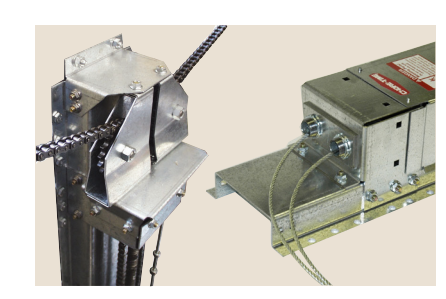
LINEAR-LIFT™ Chain-Sprocket (left) and Cable Straight-Out Models