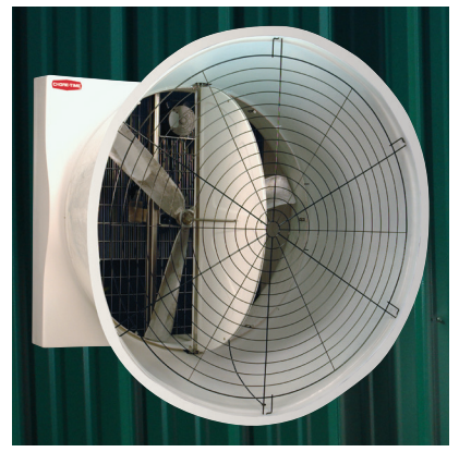
TURBO® Fans with HYFLO® Shutters