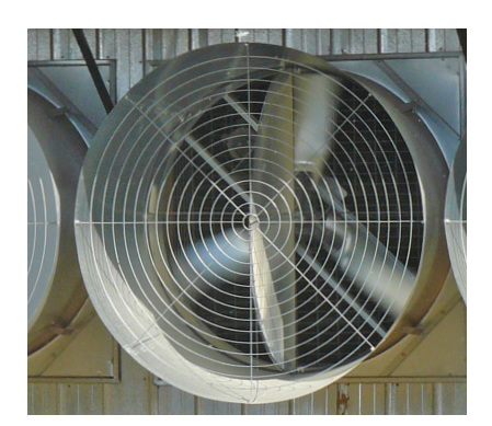
54-Inch (137-cm) Galvanized Fans