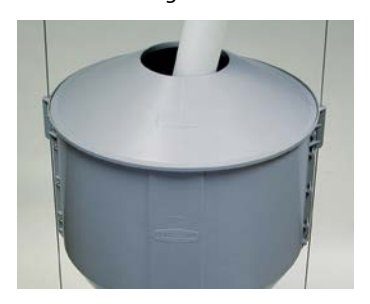
Built-in tube support holds drop tube in position and permits easy drop tube removal for house clean out.

Optional molded plastic cover helps keep birds out of hopper and includes a drop tube opening.