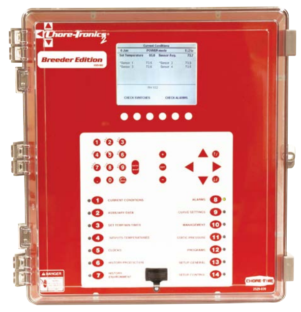
CHORE-TRONICS® 2 Breeder Control includes extra capabilities especially for breeder production.

Count on Chore-Time for experience, reliability, performance and confidence.