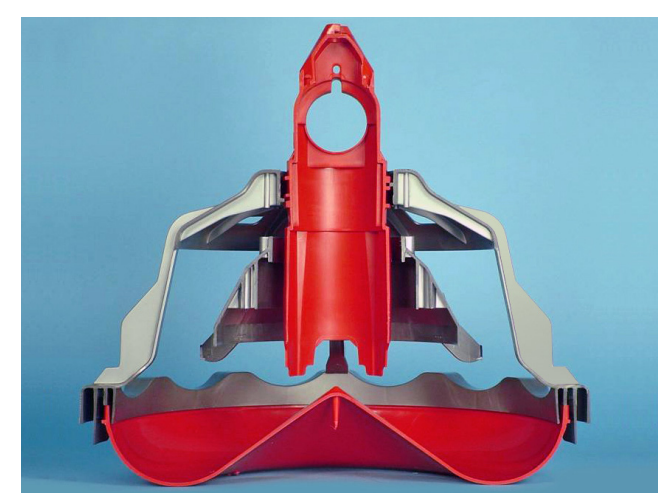
In the flood position, birds can easily see the flowing feed. The scalloped grill edge is just 2.5 inches (64 mm) at its lowest point.

What I like about Chore-Time's Liberty Feeder is the way I can adjust the flood level. I like that I can have a gradual change in flood level for my birds as they grow. Virginia Broiler Grower