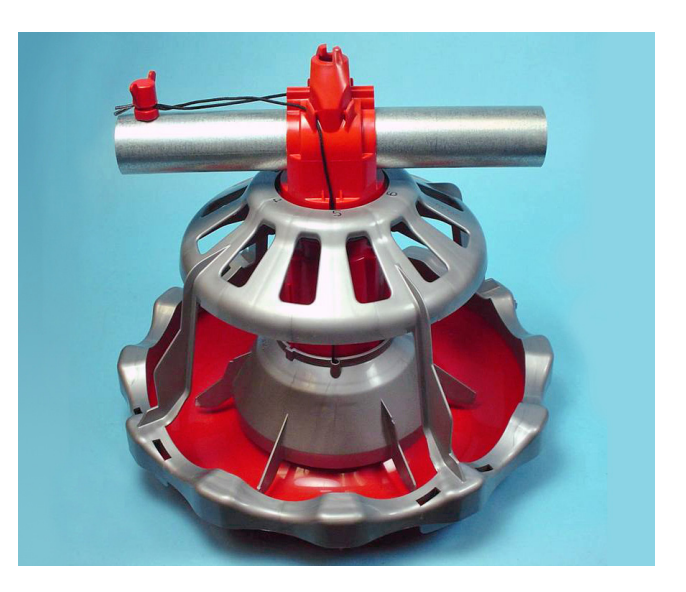
The LIBERTY<sup>®</sup> Broiler Feeder is offered with a silver feed cone . Mechanical and electronic control pans are available in both intermediate and end-control models.

Chore-Time's LIBERTY® Feeder features six feed level settings from 0.375 inches (9.5 mm) to 1.5 inches (38 mm) to control the amount of feed when the feed cone is in the lowered position.