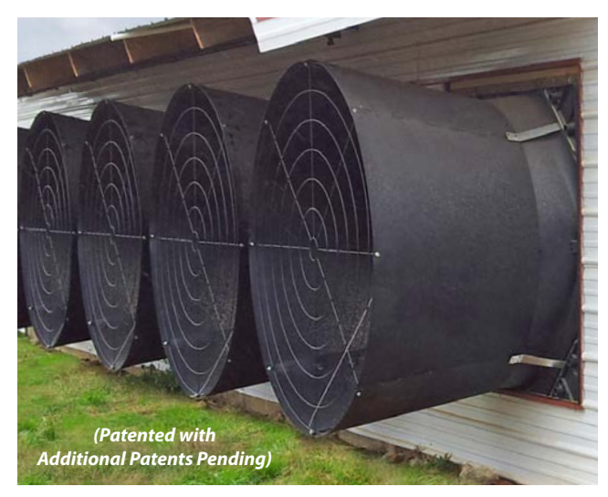
Chore-Time's 145-cm (57-Inch) ENDURA® Fan with HYFLO® Shutter features an industry-leading combination of outstanding performance and strategic material selection.