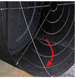
Cable attachment allows HYFLO® Doors to float left or right together for maximum efficiency.

Durable long glass fiber composite shroud and HYFLO® Shutter Doors contain 35% fiberglass for strength and to limit expansion and contraction.