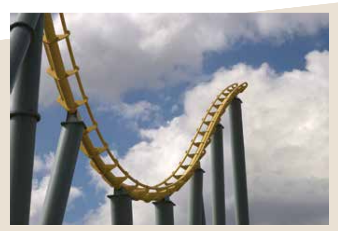
Will your supplier be along for the ride if they sell only copied feeders and component parts?

The trouble with "bargain" equipment is you never stop paying for it!