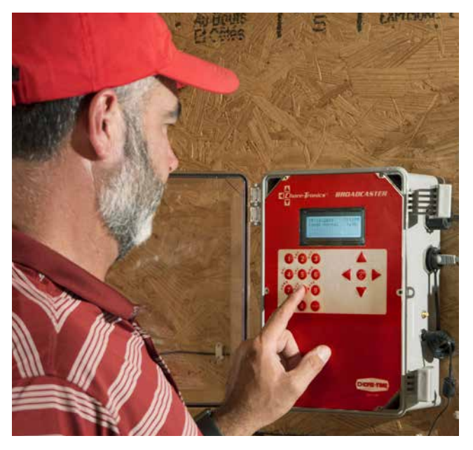
Avoid costly surprises by using Chore-Time's BROADCASTER™ Alert System. Alerts you to alarm notifications and sends the alerts to your mobile phone or land line. Calls a pre-determined list of up to 10 notification numbers.