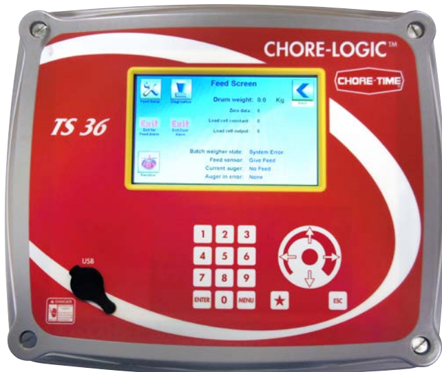
CHORE-LOGIC™ TS36 Control