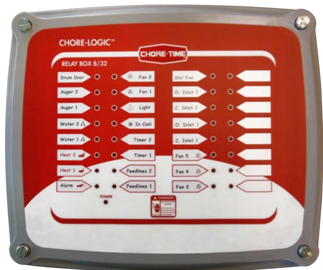
CHORE-LOGIC™ Relay Box 8/32