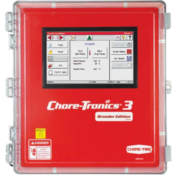
CHORE-TRONICS® 3 Breeder Control includes extra capabilities especially for breeder production.