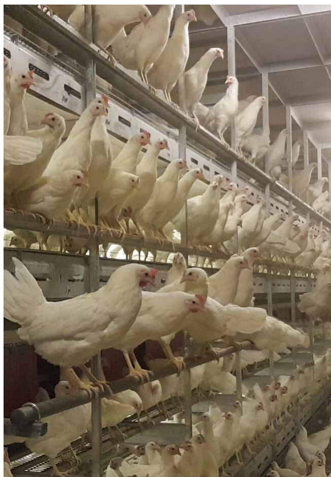
VIKE™ Aviary System for Layers

Aviary system that provides outstanding results Excellent overview and easy inspection Integrated VALEGO™ Nests