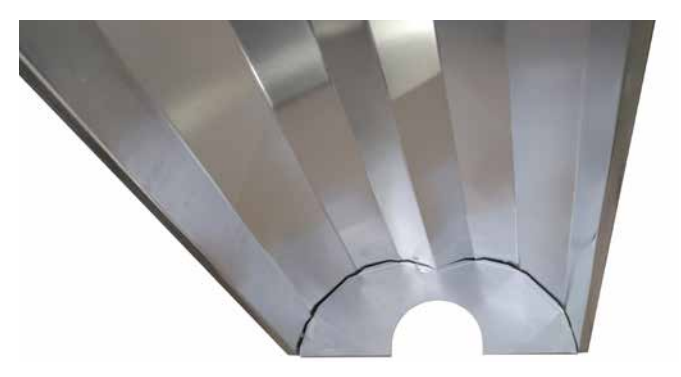
Eight angles in the reflector direct heat up to 50 feet (15.24 meters) in width.

The aluminum reflector on JET™ Heaters forms a stepped arc using eight different angles to reflect heat from the top of the tube and direct it down to the floor in a wide pattern. A single set of JET™ Heaters installed down the middle of a house can heat up to 50 feet (15.24 meters) in width.