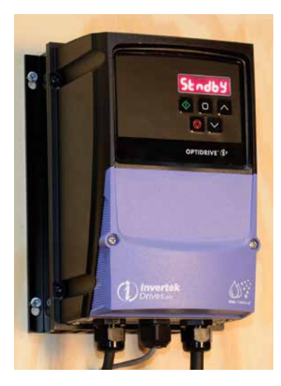
Variable frequency drive

NOTE: Inside grill has been removed for photography only.