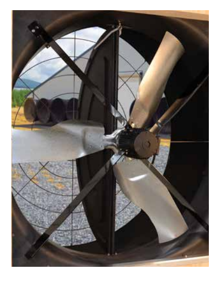
HYFLO® Shutters improve fan performance by minimizing obstructions during operation.

Direct-drive ENDURA® Fans efficiently produce one of the highest air flow ratings in the industry. Use a CHORE-TRONICS® 3 Controller, in combination with a variable frequency drive (shown below right), to achieve even greater energy savings by slowing the fan whenever air flow requirements allow.