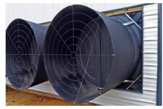
Chore-Time's 57-inch ENDURA® Direct-Drive Fan with HYFLO® Shutters features a variable speed motor to help maximize energy efficiency.

Count on Chore-Time for experience, reliability, performance and confidence.