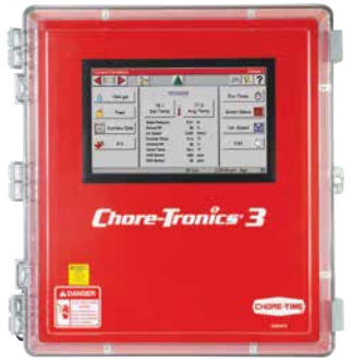
Use with CHORE-TRONICS® Controls for a complete package.