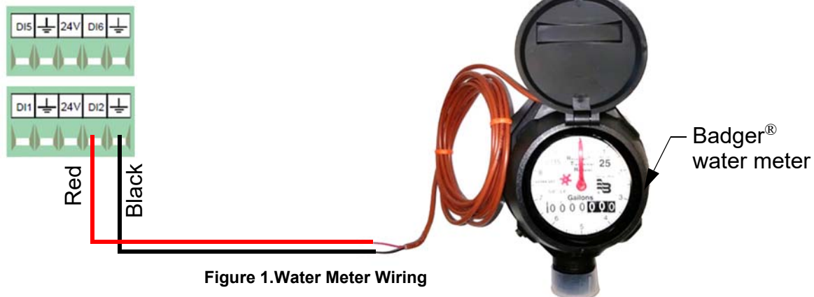
Figure 1. Water Meter Wiring

Chore-Tronics™ Control D1 of your choice