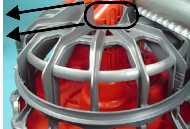
Figure 2. Feed Cone Level #2 Setting

5. Adjust feeder line height to the correct height for the incoming flock, see Figure 3.