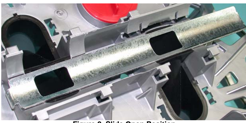
Figure 2. Slide Open Position