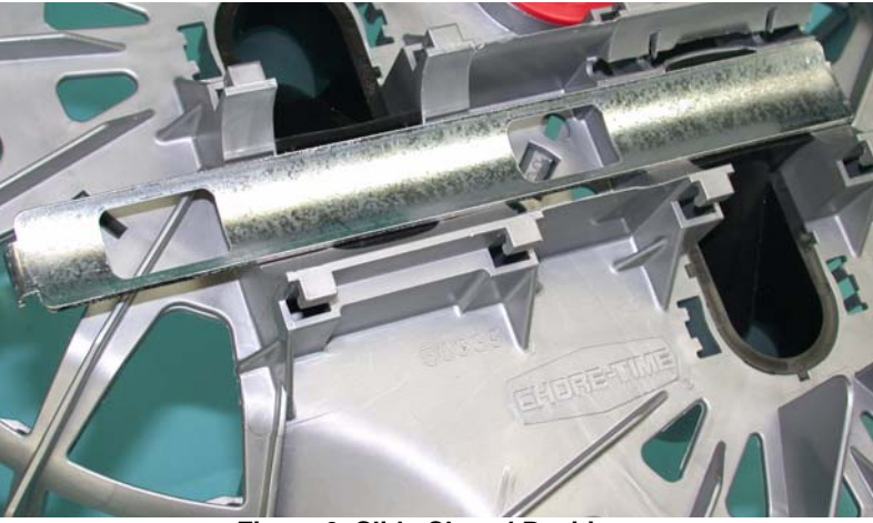
Figure 3. Slide Closed Position