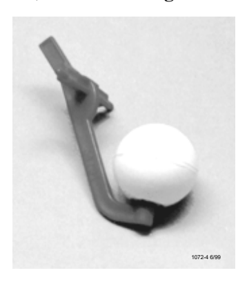
Figure 3. Float Ball Installation

3. Install the Float Ball on the Pivot Arm, as shown in Figure 3 .