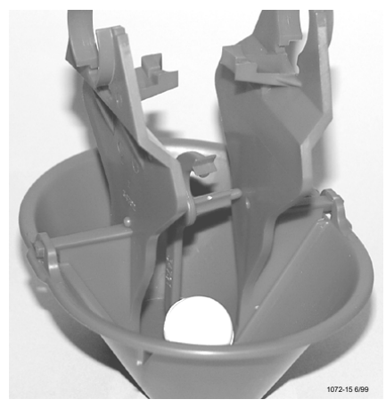
Figure 4. Pivot Arm Installation

Note: Gently spread the Mounting Brackets apart to allow the pins on the Pivot Arm to slide through the Mounting Bracket holes.