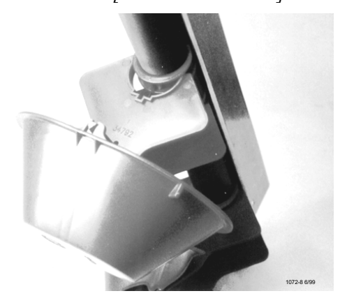
Figure 5. Mini Drinker Assembly Installation