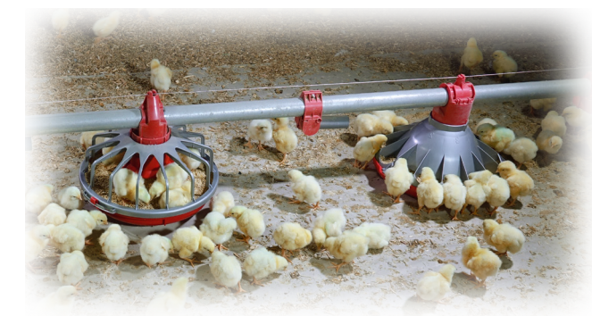
Three Days Old