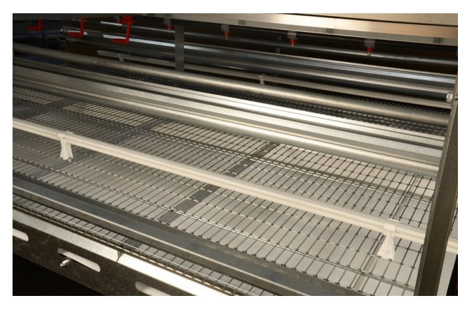
Manure belts on each level keep system and feeding areas clean