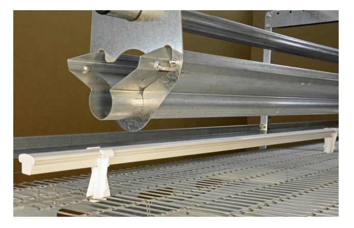
VIKE<sup>™</sup> TRADITION<sup>™</sup> Aviary System with Perch and side view of ULTRAFLO<sup>®</sup> Feeder System