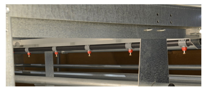
Choice of Chore-Time's drinker systems with button nipples (shown above) or straight pins with catch cups (below)