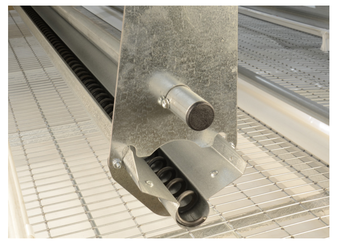
ULTRAFLO® Double-Sided Feeder for Commercial Cage-Free Layers