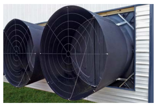
Chore-Time's 57-inch EnduraMax™ Direct-Drive Fan with HYFLO® Shutters features a variable speed motor to help maximize energy efficiency.

Count on Chore-Time for experience, reliability, performance and confidence.