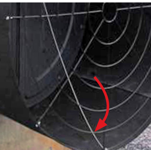
Cable attachment allows HYFLO® Doors to float left or right together for maximum efficiency.