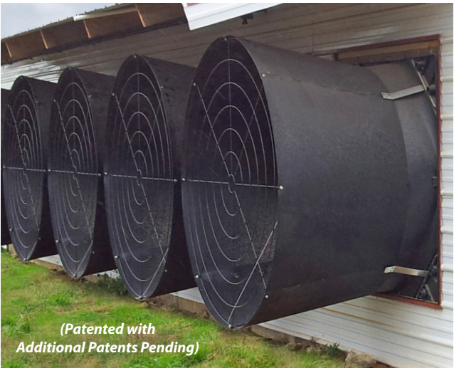
(Patented with Additional Patents Pending) Chore-Time's 57-Inch (145-cm) ENDURA® Fan with HYFLO® Shutter features an industry-leading combination of outstanding performance and strategic material selection.