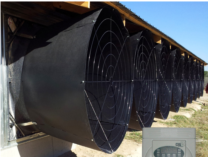
CHORE-TIME® Variable Frequency Drive