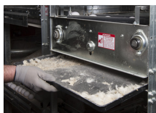
Easily removable trays below the mini rod conveyor collect foreign matter.