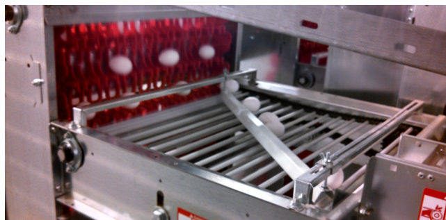
As eggs move from egg belts across a mini rod conveyor, trash drops through before eggs enter collector baskets.