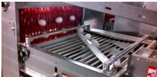
As eggs move from egg belts across a mini rod conveyor, trash drops through before eggs enter collector baskets.