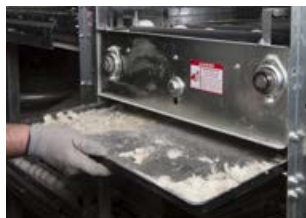
Easily removable trays below the mini rod conveyor collect foreign matter.