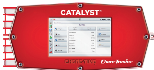
Use with CATALYST® Control for a complete package.