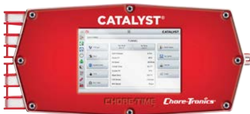
Use with CATALYST® Control for a complete package.